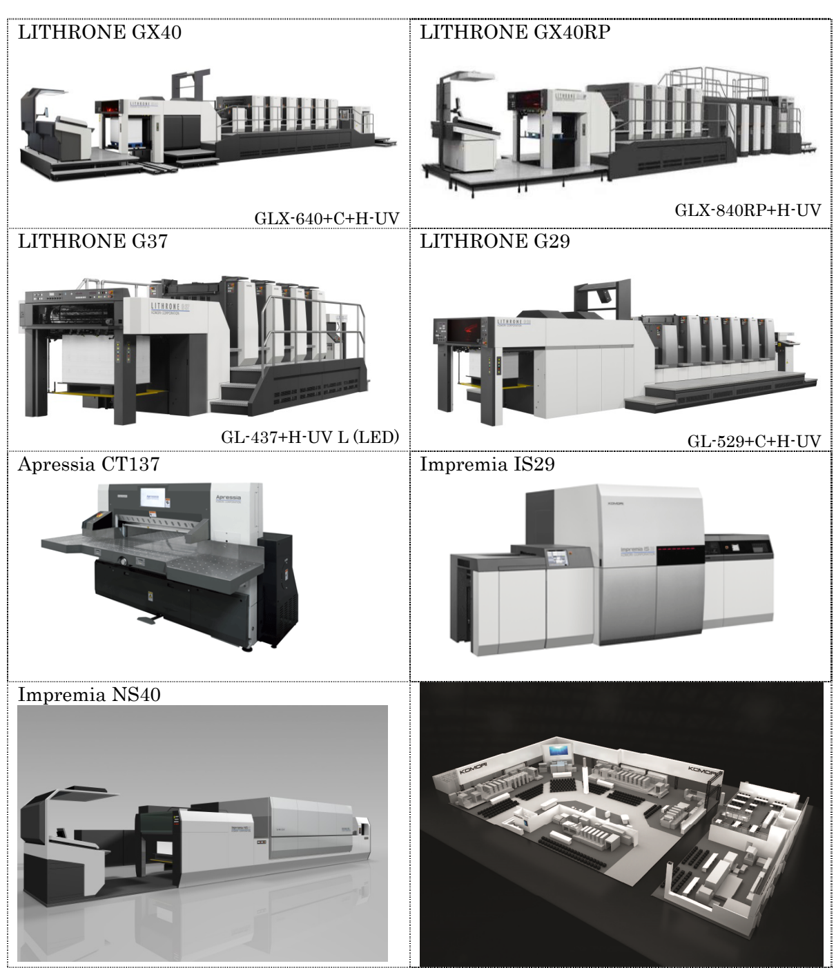
*Exhibition content is subject to change. Please be understanding of this beforehand.