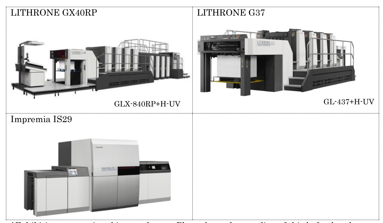
*Exhibition content is subject to change. Please be understanding of this beforehand.

An array of diverse high added value printed items from around the world. Mainly package and printed products that use special techniques will be exhibited along with an introduction to a wide variety of printing methods and application cases.